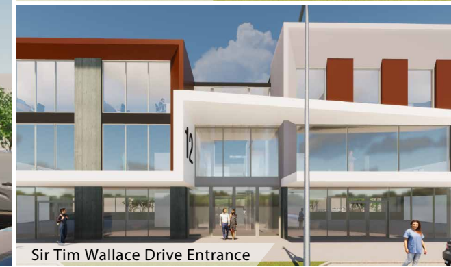
Sir Tim Wallace Drive Entrance